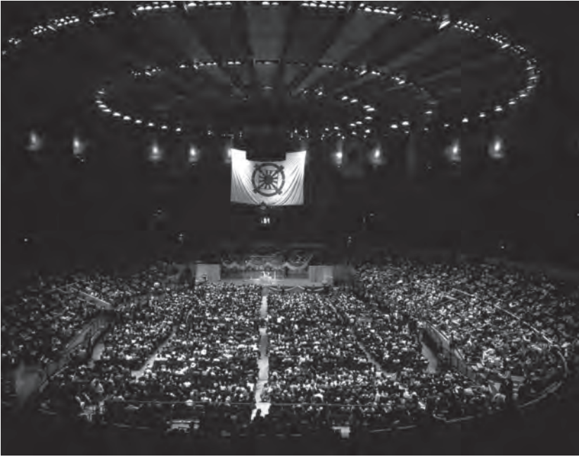
September 18, 1974: The New Future of Christianity rally, Madison Square Garden, New York

On the heels of our meeting with the president, we went out again, this time to speak in 32 cities, completing our coverage of all 50 states, including Alaska and Hawaii. At first, most Americans were perplexed to hear about a Christian leader from the East. But to know us is to love us, and wherever we went, people were touched and took something valuable from our message. Public interest increased by the day, and with it came controversy.