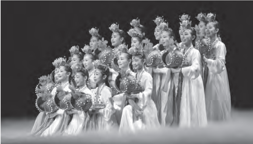
Founded in 1962, the Little Angels have performed some 7,000 times around the world.

my husband coined the Korean word, “ shimjeong ,” is the essence of beauty and original root of love. It is beauty that stimulates love to surge forth eternally. The culture of heart transcends time and space. In the world where God’s will has been realized, a pure and immaculate culture of heart will flow forth like a river and waft like a breeze through all forms of artistic creativity.