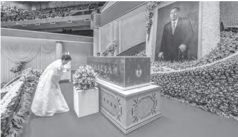
September 15, 2012: Seonghwa Ceremony for Father Moon, who ascended September 3 at the age of 93. Some 250,000 people from around the world came to pay their respects.

From the moment I could understand speech, my maternal grandmother told me, “God is your Father.” Her words formed the core of my faith. They set me on the course I had to walk. My husband, Father Sun Myung Moon, and I have lived our whole lives for the liberation of God’s homeland. We have nothing to be ashamed of, nothing to hide. I have never looked back, nor to the left or the right; I have only looked at the path ahead. I never became attached to my circumstances. Night or day, there has never been a moment that I did not keep Heavenly Parent with me. In the Kremlin, we said to the leaders that they should remove the statues of Lenin and accept God. In the presidential residence in North Korea, we spoke out. On that foundation, President Mikhail Gorbachev and Chairman Kim Il Sung opened their hearts. We never wavered for the sake of the liberation of God’s homeland. Whenever crises arose, Heavenly Parent guided us with pillars of fire and cloud.