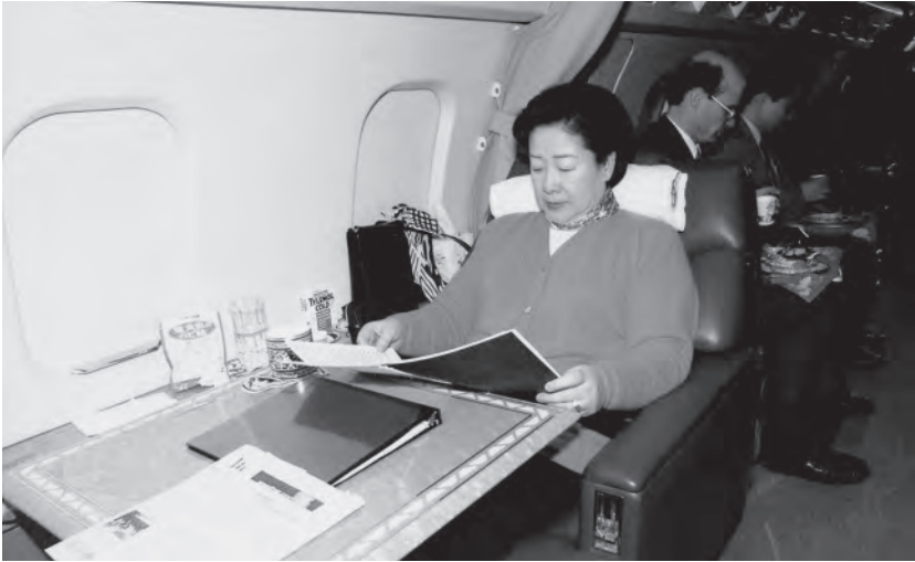
Mother Moon studying her speech as she travels between countries