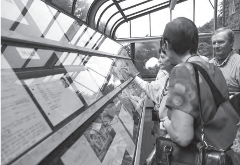
May 2017: At a reunion for the 1975 international missionaries, participants review a display of their original reports and letters, now carefully archived at the East Garden Museum in Irvington, New York.

my husband's words, shared late one evening: "There will always be reasons that we cannot send them. But if we do not send them now, we will never send them. There will never be a moment without difficulties. Let us make a firm decision when things seem the most difficult."