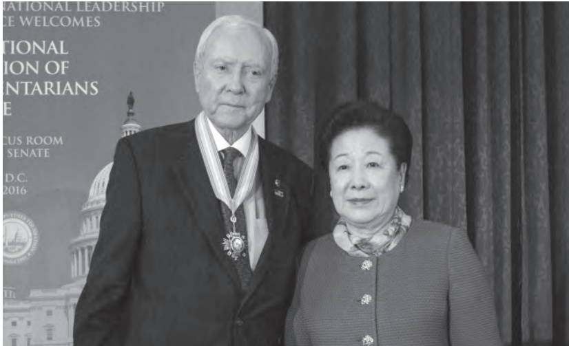
November 30, 2016: Mother Moon with US Senator Orrin Hatch at the United States Capitol

expressed their pleasure at participating in a global event for peace. The words of Hon. Gilbert Bangana, representing the president of the National Assembly of Benin, touched people’s hearts: “When I was young, I learned Father and Mother Moon’s principles of peace, and today I continue to practice their peace philosophy.”