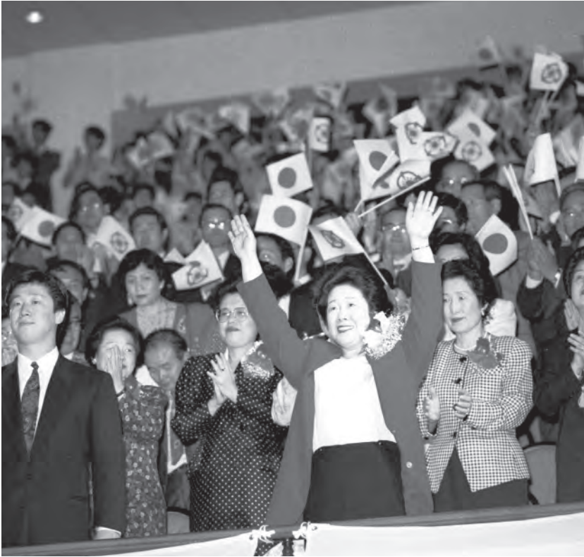
September 18, 1991: Mother Moon at a speaking event in Japan, with eldest son Hyo-jin

time, the path of a true wife and the path of a true daughter. Women have the magical power to create harmony and to soften hearts. Brides build bridges. The world of the future can be a world of reconciliation and peace, but only if it is based on the maternal love and affection of women. This is the true power of womanhood. The time has come for the power of true womanhood to save the world.