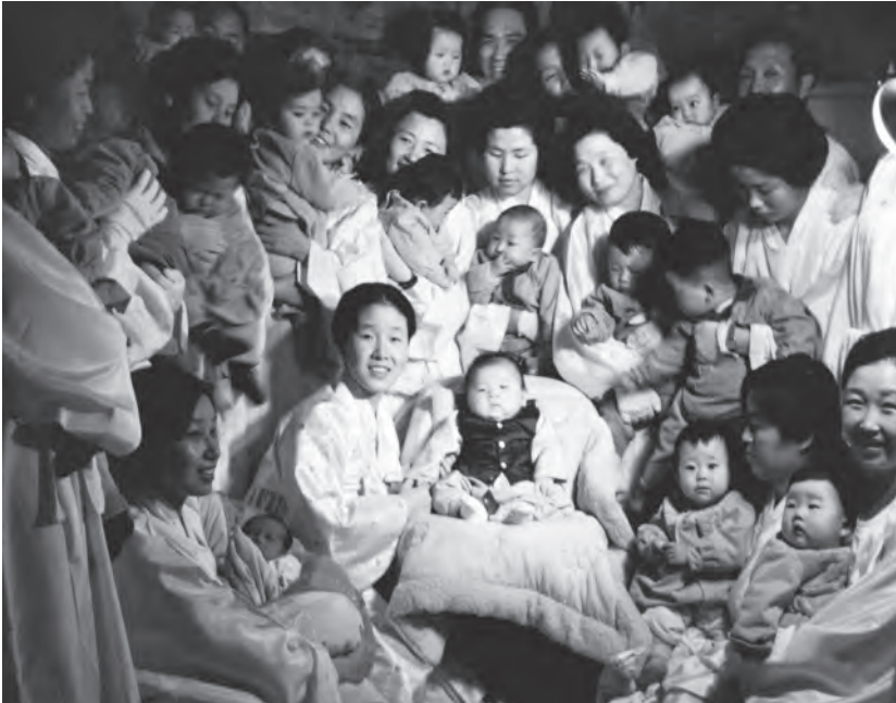
Mother Moon together with Unification Church wives and their young children

When I was pregnant I craved tangerines, but we could not afford them; they were so expensive. One member learned about this, however, and bought some tangerines for me. I ate six or seven of them on the spot. I was so grateful, I cried.