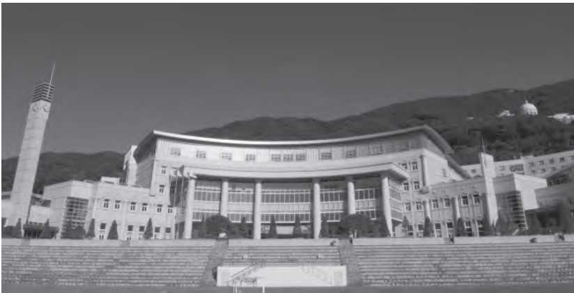
Cheongshim International Middle and High School (Gapyeong-gun, Korea)

CheongShim International Academy, overlooking Cheongpyeong Lake, is another international middle and high school. We invested a