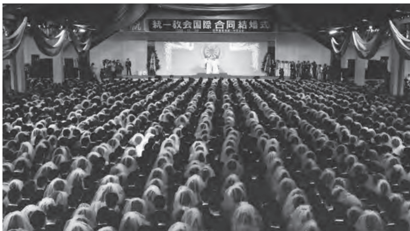
October 30, 1988: The 6,500-couple International Blessing Ceremony brought thousands of multicultural families to Korea.

especially seen after our International Blessing Ceremony for 6,500 Korean-Japanese couples in 1988, the year the Summer Olympics was held in Seoul.