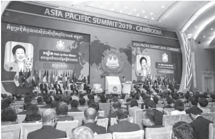
November 19, 2019: The Asia Pacific Summit Opening Plenary, Phnom Penh Peace Palace, Cambodia

Pacific civilization, the final point of settlement in Heaven’s providence. I stated that the Pacific civilization will be one of true love characterized by attendance to God as the Heavenly Parent. In the presence of several current and former heads of state and ambassadors, His Excellency expressed support for the vision of regional peace anchored in the Asia-Pacific Union initiative I had proposed.