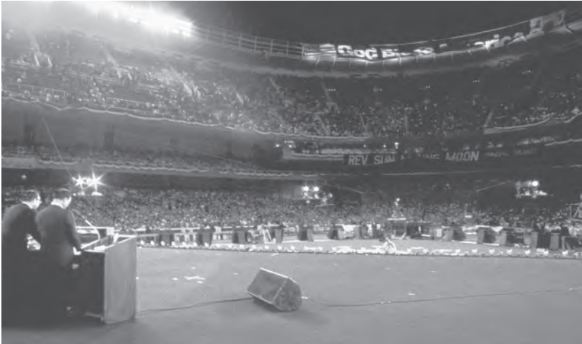
June 1, 1976: The God Bless America Festival, Yankee Stadium, New York

the tri-state area and our supporters from other states and nations gathered.