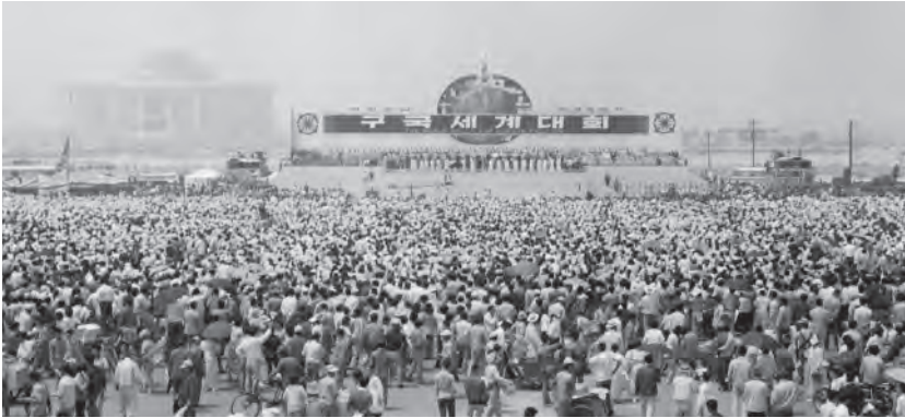
June 7, 1975: the World Rally for Korean Freedom, Yoido Plaza

Without a moment's rest, we held even more rallies that impacted the world. Our confidence to fill large arenas led to greater gratitude to God, our Heavenly Parent, and to our members who were, and are, devoted to Heaven's principle and providence. In the midst of this, in Korea, we displayed the power of the Victory Over Communism (VOC) movement at a rally of 1.2 million on Yoido Island in Seoul. This led to a nationwide movement aimed at the reunification of North and South Korea in the 1980s. The VOC teaching spread beyond Japan and Asia. Through the Confederation of Associations for the Unity of the Societies of the Americas (CAUSA), leaders in the Western Hemisphere, including national leaders in Latin America and 70,000 members of the clergy, attended the CAUSA workshops.