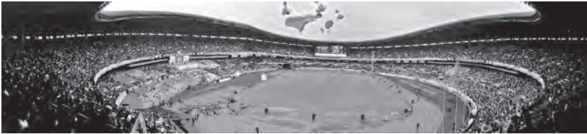
April 10, 1992: 150,000 attend the inaugural rally of the Women's Federation for World Peace in Seoul

My husband and I founded the Women's Federation for World Peace. After its inaugural rally at the Olympic Stadium in Seoul in April 1992, about which I will also speak below, I held a series of events to launch Women's Federation chapters in 40 Korean cities. I spoke on the theme, "Women Will Play a Leading Role in the Ideal World." We wondered what would be the turnout for these events and were gratified that every venue was filled to capacity. Although the speech focused on women, many men attended as well. I saw the era of women that my husband and I were advocating taking shape before my eyes.