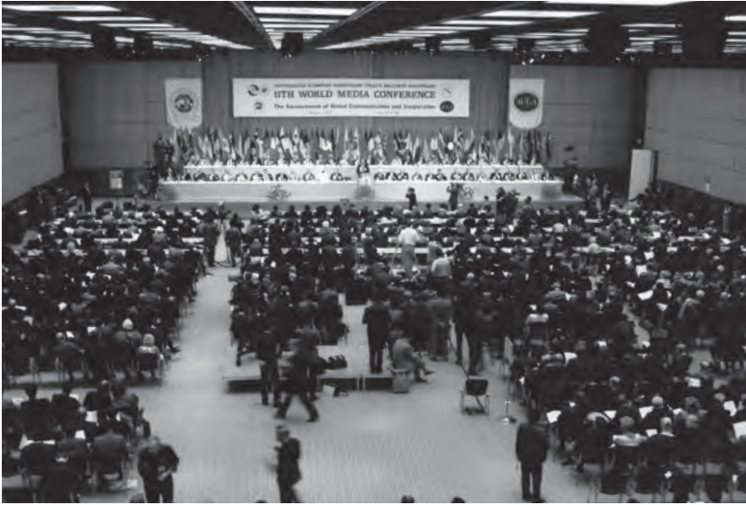
April 9, 1990: The 11th World Media Conference, Moscow