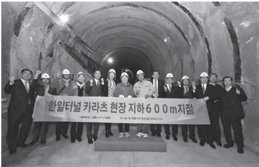
November 14, 2016: At the construction site of a test tunnel built for the Korea-Japan Underwater Tunnel, Karatsu, Kyushu, Japan

That highway would pass through a tunnel connecting Korea's Busan with Karatsu, and there, in 1986, we commenced a pilot tunnel construction. I had long been interested in visiting the site. Finally, in 2016, I had the opportunity to go and see it. During my visit, I renewed our movement's commitment to the peace highway. I believe that the world's peoples are ready for this and that the time is ripe for launching the project based upon a global plan. To tell this story to the world, from the streets to the senate buildings, I had already created an affiliated project, "Peace Road." It consists of public activism publicizing the international highway, and it has turned into a global movement for peace. I'll share more about Peace Road later.