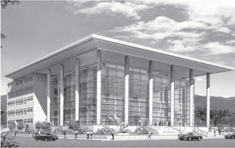
August 5, 2007: Opening of the World Peace Center in Pyongyang, built by the Unification movement.

Soon after the completion of our eight-day mission, North Korea's Prime Minister Yon Hyong-muk led a delegation to Seoul and signed a "Joint Declaration on the Denuclearization of the Korean Peninsula" with the South Korean government. Over the coming months, our movement set up an industrial enterprise, the Pyonghwa Motors factory, as well as the Botong River Hotel and the World Peace Center, all in Pyongyang, as the cornerstone for unification. Afterwards, the seeds planted by my husband and I at that time bore fruit with the visit of the South Korean president to North Korea to discuss the path toward unification. On that foundation, the shoots of peace and unification are growing. When those shoots blossom into full bloom, the earnest prayers my husband and I have offered for Korean unification will be remembered forever.