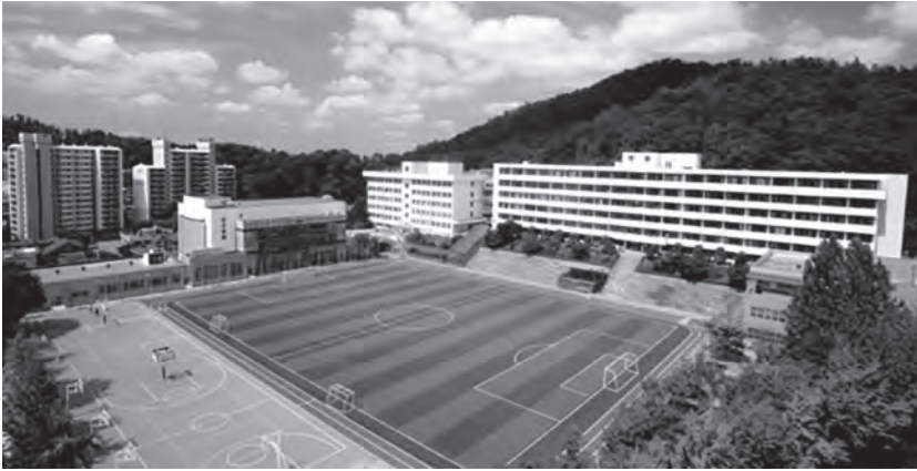
Sunjung Middle and High School, and International Tourism High School (Seoul)

This school is now affiliated with our Sunhak Educational Foundation. Applying our philosophy, it has become an exemplary educational institution. Our foundation includes three other specialized schools. Kyong Bok Elementary School, which opened in 1965, has a proud history and tradition. Sunjung Middle and High School produces competent young people by offering character education based on heart, in addition to excellent academics. These schools have international student bodies living and studying together with the aim of becoming global leaders. Another school, Sunjung International Tourism High School, prepares leaders for the hospitality industry. At that school, every year on National Teachers' Day, we invite teachers who have defected from North Korea to attend our Teachers' Day Event, in preparation for the day when the two Koreas will be reunited.