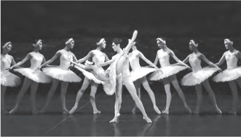
A scene from Swan Lake, performed by Universal Ballet in North America and Europe. Universal Ballet was founded in 1984 and has given some 1,800 performances, presenting some 100 ballets in 21 countries.