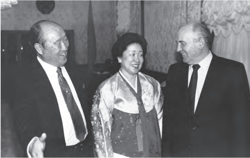
April 11, 1990: Father and Mother Moon with President Mikhail Gorbachev

tone in our chat after the prayer. “Mrs. Hak Ja Han Moon,” he remarked, “I do like your traditional Korean dress. It looks beautiful on you.”