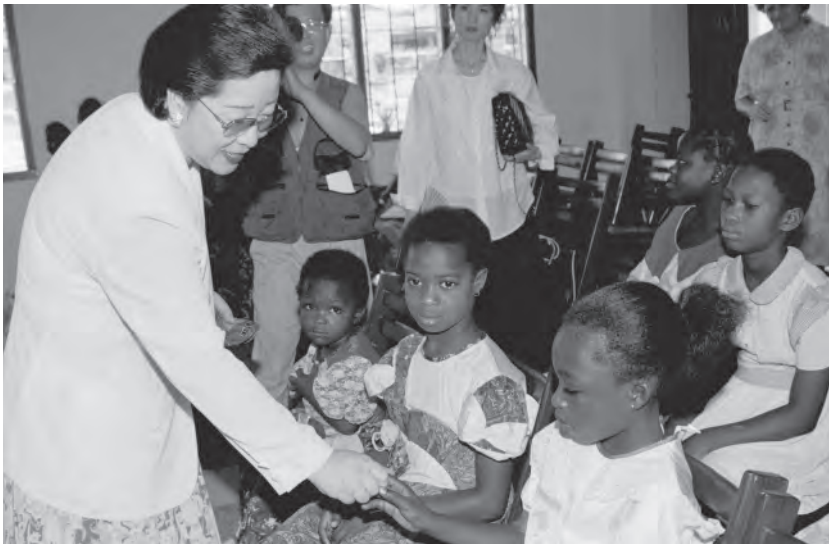
November 18, 1995: Visiting a social welfare center in Accra, Ghana

to give all I have as gifts to those who are working hard day and night for the providence. Just as I did at the Cheongpa-dong Church and the Hannam-dong residence in Seoul, here in Cheongpyeong I open up our closet and give away clothes and shoes when missionaries and guests visit. My husband's shirts and pants, belts and neckties, along with my clothes and accessories, find new owners. When I see the hard-working members, I feel at ease only after giving them something, even if it is small.