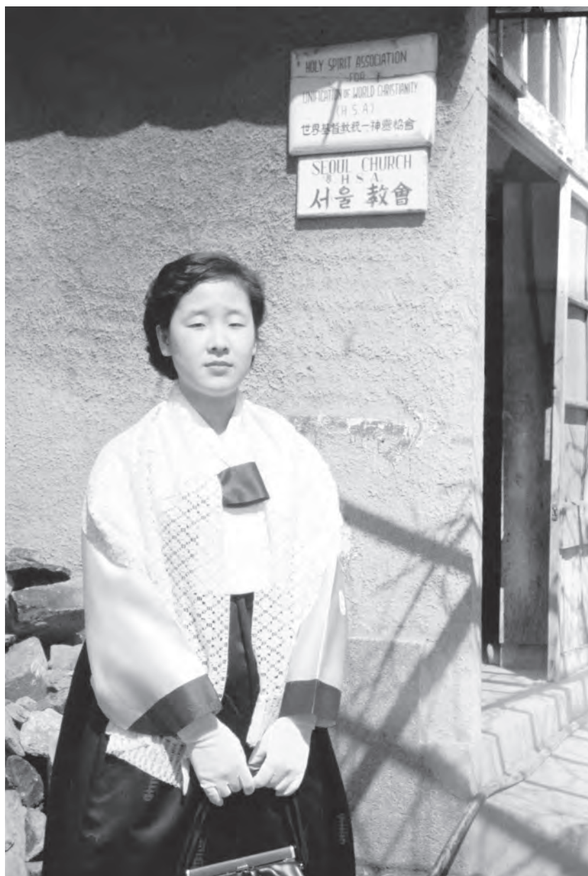
Mother Moon as a young wife, standing in front of her home, the Headquarters Church in Cheongpa-dong, Seoul (1960s)