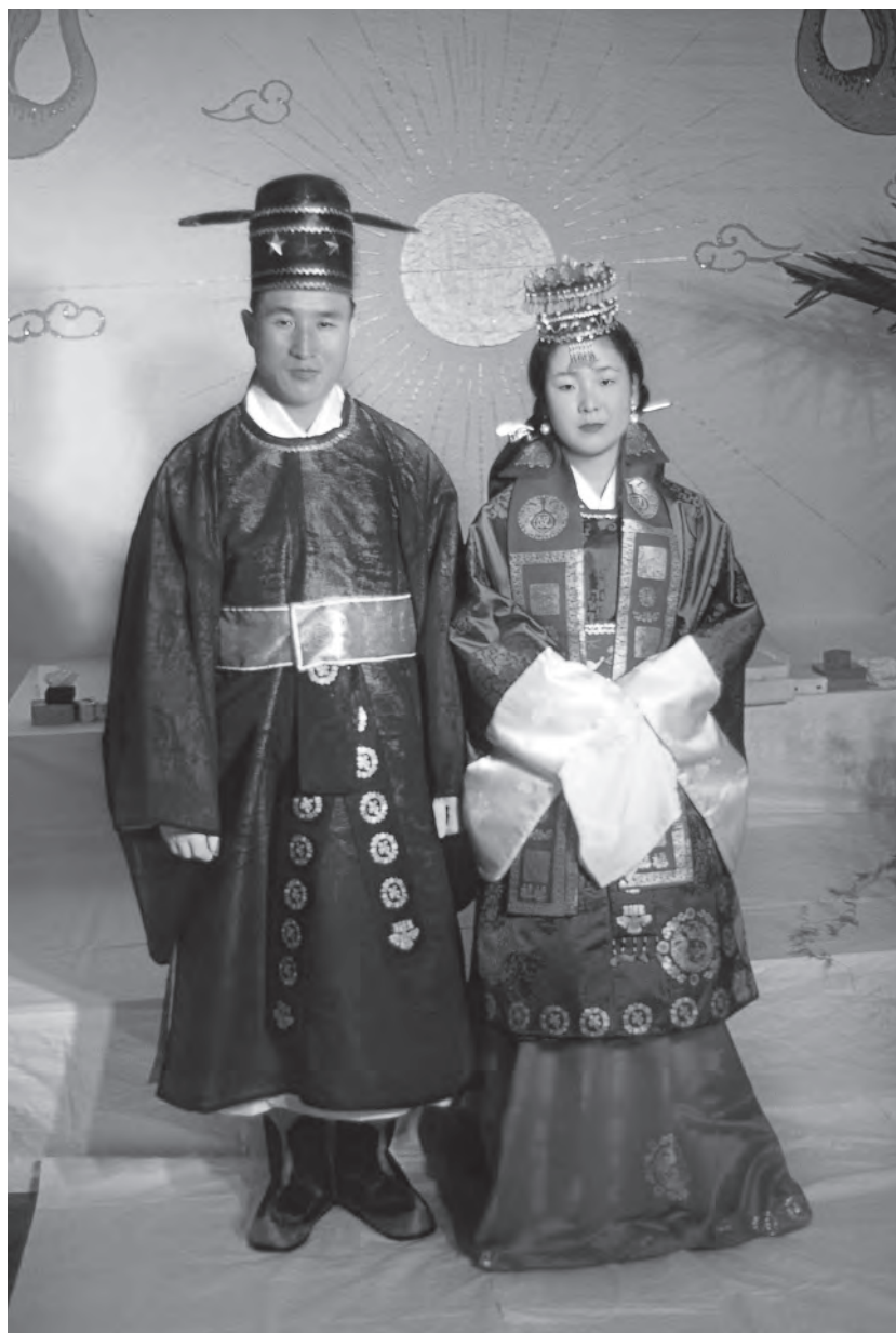
April 11, 1960: The second part of the Holy Wedding, in traditional Korean attire