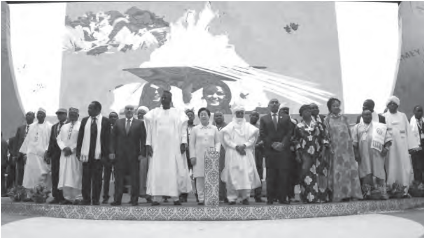
November 29, 2019: The Family Renewal and Blessing Festival in Niamey, Niger

proclamation, beginning in June, the Universal Peace Federation and other organizations began working to secure the support and participation of African governments in the “Heavenly Africa Project,” a package of 10 projects aimed at promoting peace and development that includes the True Family Blessing Movement. At times, it took as many as 10 days for our delegates to meet with a head of state. As it wasn’t unusual for meetings to be rescheduled, our delegation would skip meals and be on standby for many hours to ensure the meetings would happen.