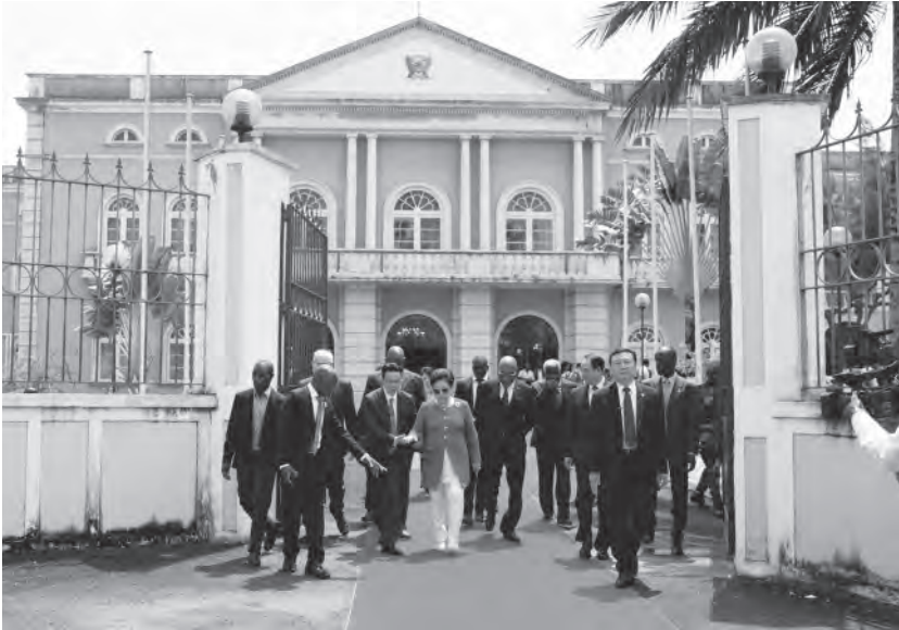
September 4, 2019: At São Tomé and Príncipe's presidential palace

Presidential honor guard escorted me to the National Assembly building to open the Summit.