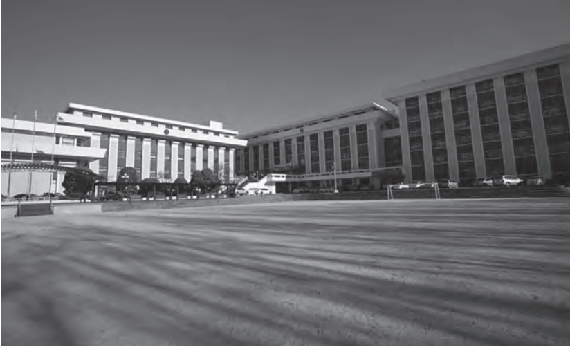
Sunhwa Arts Middle and High School (Seoul)

These schools have produced internationally renowned vocalists and ballerinas. When you leave the school through the main gate, you see a sign engraved with the words, “Gateway to the World.”