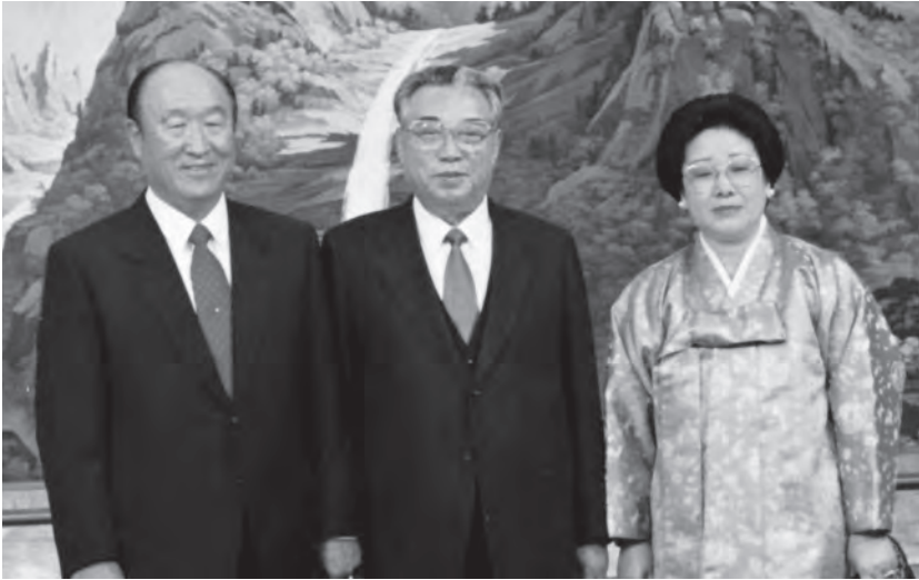
December 6, 1991: Meeting with North Korean leader Kim Il Sung; Father and Mother Moon were in North Korea for eight days.

The first order of business was lunch, and while we ate, we began our conversation by unreservedly sharing small talk about such things as hunting and fishing. Gradually, Father Moon and I introduced our current activities, including the World Culture and Sports Festival planned for the coming August. Hearing that it would include a Blessing Ceremony for 30,000 couples from around the world, Chairman Kim offered the Myeongsasimni Beach in North Korea's beautiful Wonsan district, where the sweetbriar is beautiful, as its venue. He also promised to open the port of Wonsan to transport all the couples to that site. Then all of a sudden, there were so many things to talk about. The conversation took on an energy of its own and continued far beyond its scheduled closure. My husband embraced his enemy, whom he had been preparing for decades to meet, with deep and intense love. Chairman Kim was impressed by our sincerity and accepted our proposals in a bright manner throughout the meeting.