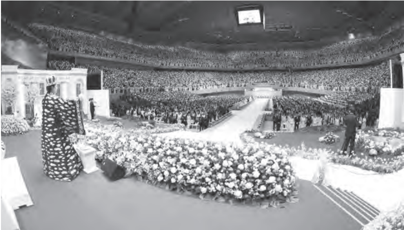
February 22, 2013: Mother Moon proclaiming the coming of God's kingdom of Cheon Il Guk at the Peace World Center, HJ Cheonwon, South Korea

Standing before True Father's holy body in 2012, I promised in tears, "By the end of my days, I will absolutely bring about the settlement of Cheon Il Guk on this earth!" Whenever the opportunity arises, I repeat these words. After True Father's ascension, I set forth like a female Don Quixote spreading our teachings and embracing the world. I have lived every day with my promise to Father Moon in mind.