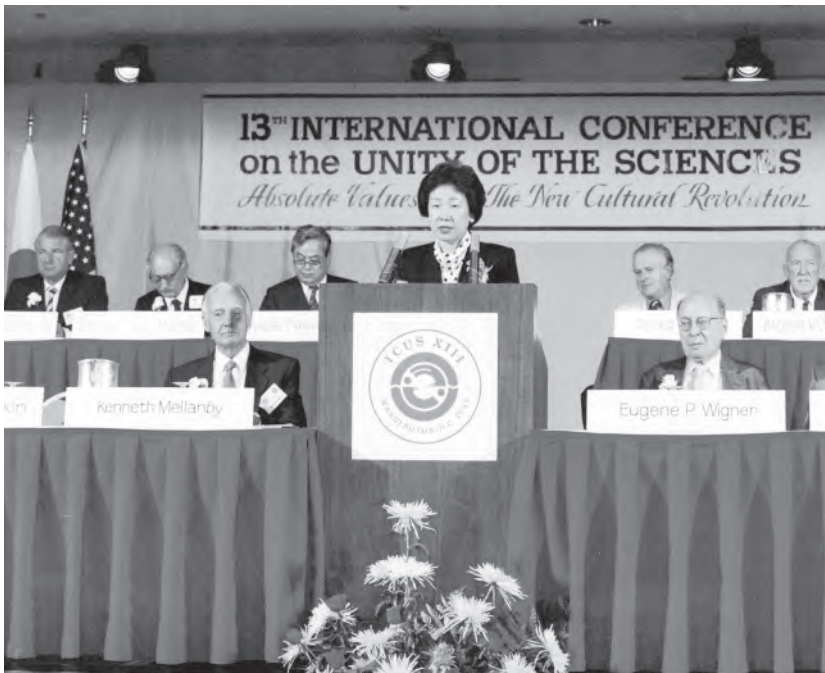
September 2, 1984: The 13th ICUS in Washington DC. Mother Moon read the welcoming address on behalf of her husband.

Despite Father Moon’s incarceration, our global work for peace continued. The 13th International Conference on the Unity of the Sciences