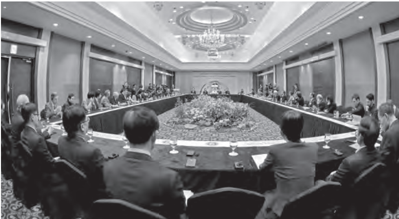
February 23, 2018: The 24th ICUS (Seoul); following a hiatus since the year 2000, ICUS was relaunched with the 23rd ICUS in 2017

We purchased automobile assembly lines in Germany and established automobile factories in China and North Korea. When we saw farmers doing the back-breaking work of sowing rice by hand, we acquired an agricultural machinery factory and supplied them with the equipment they lacked. Looking upward into the sky, we established Korea Times Aviation to support state-of-the-art aviation technology and space engineering. These efforts and more naturally go through ups and downs, but our vision is unchanging. We learn as we go and our investment will continue.