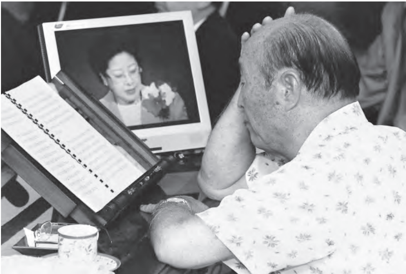
Father Moon attends Mother Moon's speech via the internet

Over the months following that event, I traveled the world to encourage women leaders and launch a true women's movement that could win the