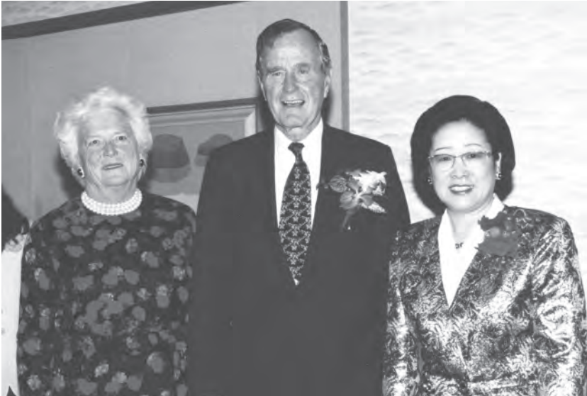
September 13, 1995: Mother Moon with George and Barbara Bush at the third anniversary celebration of the founding of the Women's Federation for World Peace, Tokyo

Women need to fulfill the mission of the wife as well as the mission of the mother. Both are essential to create a peaceful and just world. The mother gives birth to children and is called to raise them through their formative years. That is a right and responsibility given primarily to women.