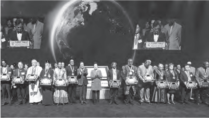
December 28, 2019: World Clergy Leadership Conference (WCLC), Rally of Hope, Newark, New Jersey