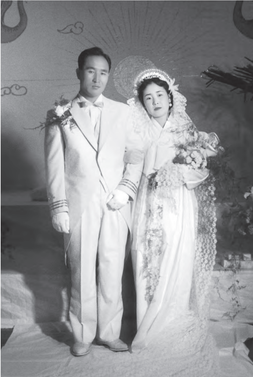
April 11, 1960: The first part of the Holy Wedding, in western attire