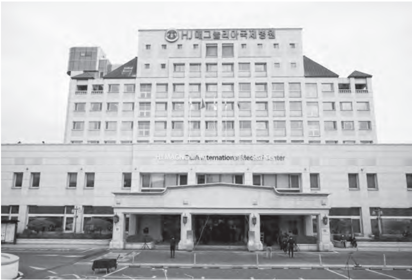
HJ Magnolia International Medical Center, HJ Cheonwon, South Korea

To address this, Father Moon and I decided to realize the dream I had when I attended nursing school. We established an international hospital in Korea where all people can receive expert spiritual and physical care and feel a mother's touch.