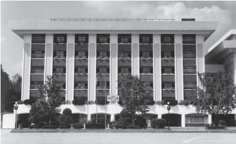
Kyung Bok Elementary School (Seoul)

Despite the postwar chaos, I graduated from Seongjeong Girls' Middle School in Seoul. I cannot forget that school, my alma mater and cradle of my life. The school you attend during your teenage years can be a significant influence on your future. When I visited the school 30 years later, its name had changed to Sunjung, but some of my teachers were still there. They remembered me and, of course, I had not forgotten them. We were overjoyed to see one another and talked for a long time about those difficult days in the past.