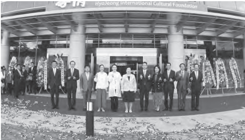
August 11, 2019: Dedication of the Hyojeong International Cultural Center, HJ Cheonwon, South Korea

After a warm welcome by Nepalese students and citizens upon the arrival in Kathmandu, the Little Angels performed brilliantly at the inauguration of the International Association of Parliamentarians for Peace, an event that took place in 2016. The Nepalese were deeply moved by the concert held at the presidential palace as well as in other performance halls, and their media gave the Little Angels high praise: "The Little Angels are representatives who are answering God's call; they are guardian angels, spreading peace worldwide."