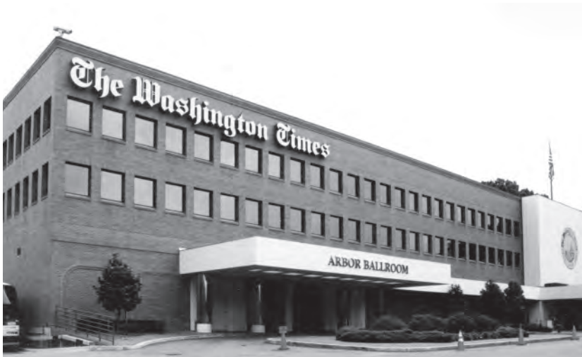
May 17, 1982: The Washington Times, Washington, DC

There was a need for a newspaper in Washington that would protect faith, freedom and family values, and no American conservatives were willing to step into the breach. When my husband and I decided to take this on, people trying to be prudent and wise told us again and again that it would be difficult to publish a new newspaper in the capital of the United States. We had never shied away from a task because it was difficult, and we didn't then.