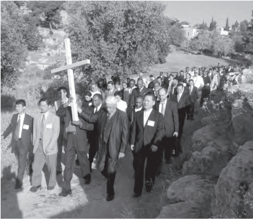
2003: ACLC clergy and participants march to the Field of Blood, Jerusalem

As the world ushered in the new millennium, the American Clergy Leadership Conference took our ministry for peace in the Middle East to a new level. This initiative was to bring reconciliation between Jews and Christians. Based on this call for Christians to embrace the Jewish people, it was discovered that the cross is a barrier to that unity. Therefore Christians called for the "end of the era of the cross," taking down their crosses and focusing on the resurrection and victory of Jesus in love. In May 2003, members of the Christian clergy from the United States and Europe as well as Israel marched through the streets of Jerusalem carrying a cross. In a prayer of repentance and forgiveness, they buried that cross in the Field of Blood, which is said to have been