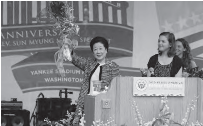
2016: The 40th anniversary of the Yankee Stadium Rally, Belvedere, New York

backgrounds. My husband and I toured the United States to encourage and inspire not just the public, but our members. We called them to establish schools, create newspapers, get their doctorates, link cultures through programs such as the Little Angels, dance troupes and rock bands, raise funds going shop to shop and door to door, create home churches, fish businesses and restaurants, and organize volunteer service projects. On every path we trod, the blood, sweat and tears of our frontline missionaries, domestic and international, continued to flow. I was constantly in prayer.