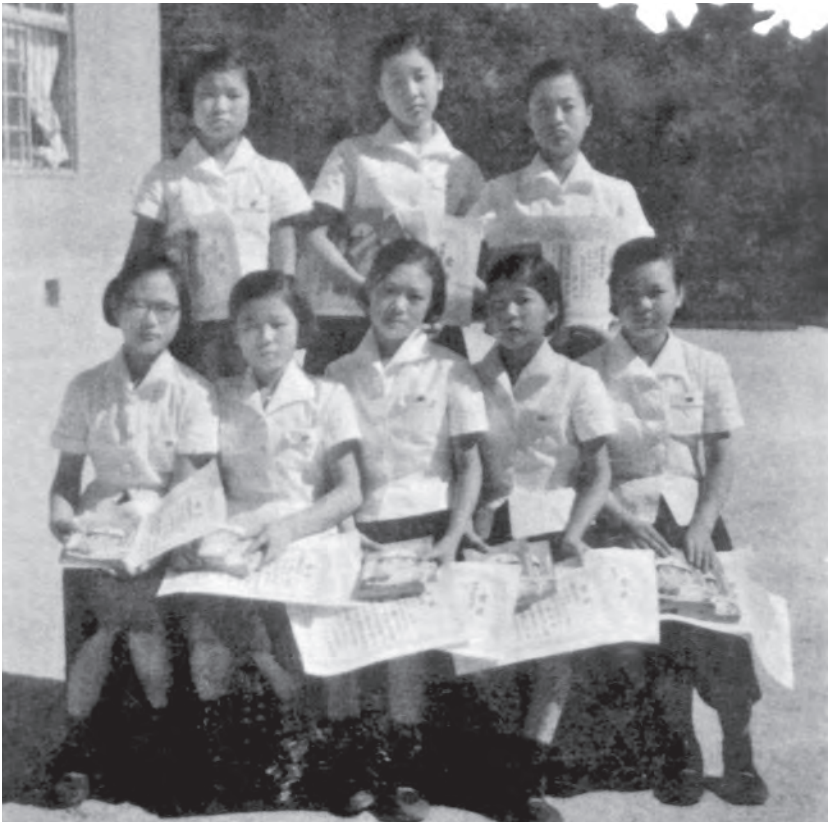
1956: Together with classmates from her art class in Seongjung Girls' Middle School (at back, center)