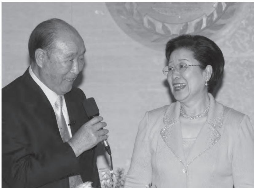
Father and Mother Moon, East Garden, Irvington, New York

right, because I always sat next to my husband during meals, not facing him. And then, when the food was served, my husband seemed uninterested in eating. He just gazed at me as if he were trying to engrave my face in his heart. I smiled and placed a spoon in his hand and something from the side dishes on his plate. “These vegetables are delicious, so take your time to eat,” I said.