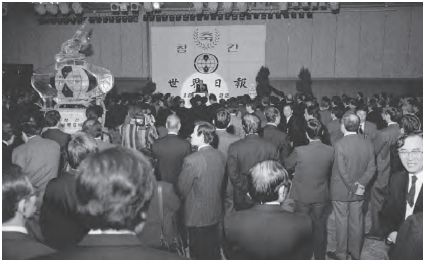
February 1, 1989: Founding of Segye Ilbo, Seoul, Korea

As well as launching newspapers in Japan and the United States, our movement launched Tiempos del Mundo in Latin America and The Middle East Times in Istanbul. But it was only in 1989 that the Korean government instituted the freedom of the press that allowed us to launch the Segye Ilbo newspaper in Seoul.