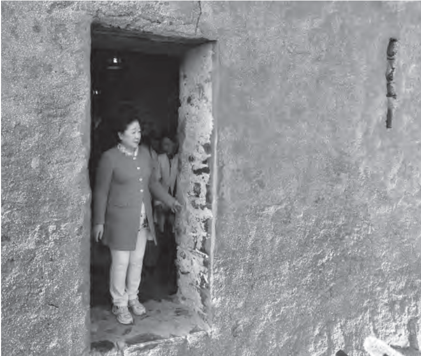
January 19, 2018: The Door of No Return at Gorée Island, Senegal