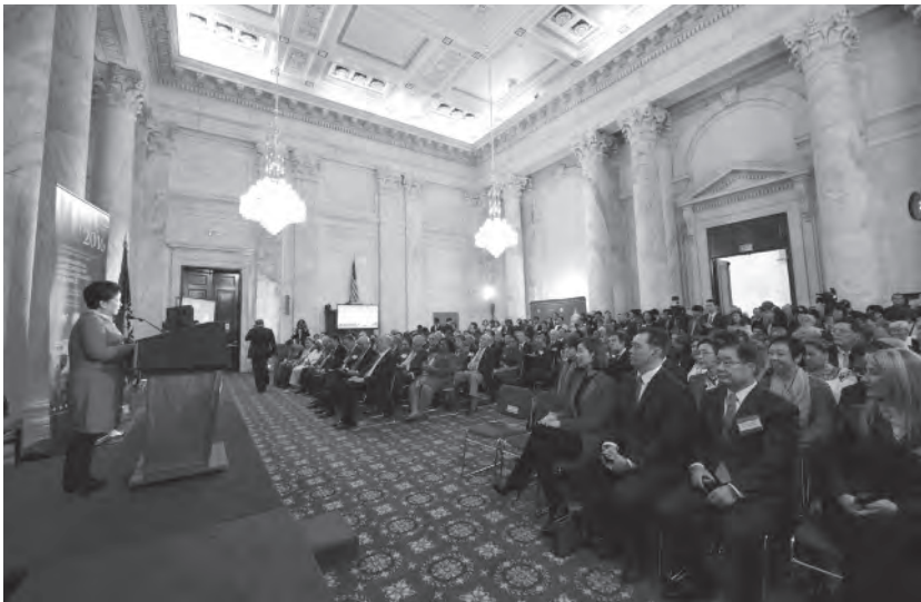
November 30, 2016: Establishment of the International Association of Parliamentarians for Peace, Kennedy Caucus Room, Russell Senate Office Building, Washington DC

The Kennedy Caucus Room is where John F. Kennedy declared his presidential candidacy in 1960. The Senate voted in 2009 to name the room in honor of the three Kennedy brothers. The room has seen numerous meetings on matters of great significance in United States and world history. It was a most fitting venue for the momentous launching in North America of the International Association of Parliamentarians for Peace.