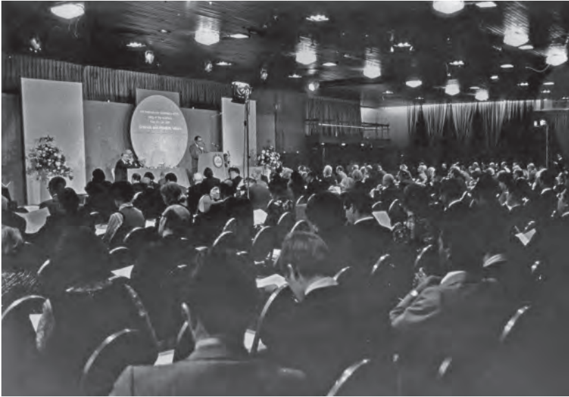
Father Moon gives the founder's address at an early ICUS

By 1981, when we held the 10th ICUS in Seoul, 808 scholars attended from approximately 100 nations; ICUS had become the leading global forum of its kind. During that event, we proposed the free and generous exchange of technology among nations, something that had never been imagined in history. Our view is that because science and technology are revealed and given by God, they are the common wealth of all humanity. We emphasized that no country should monopolize these common assets. My husband and I sponsored the ICUS forums to promote the free exchange of science and technology.