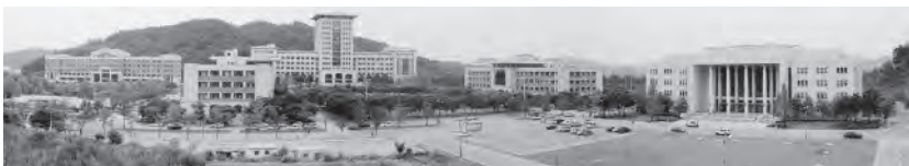
Sun Moon University (Asan City, Korea)

Just as a tree with deep roots grows well, universities develop best when they stand on solid principles and academic research. Sun Moon University sets high standards for its professors, and the lights in their offices are often on deep into the night as they interact with fellow scholars around the world. It is not uncommon for online conferences to continue until dawn.