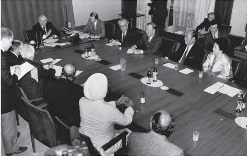
April 11, 1990: Media conference participants meet with President Gorbachev at the Kremlin

to allow freedom of religion. President Gorbachev's face showed he was well aware of the enormity of Father Moon's advice, yet he could not help but receive what we said. Never before had anyone said anything like that in the Kremlin. Looking back, I feel confident to say that the words we exchanged at that moment changed the history of the world. I truly felt that heaven and earth were listening to every word with bated breath.