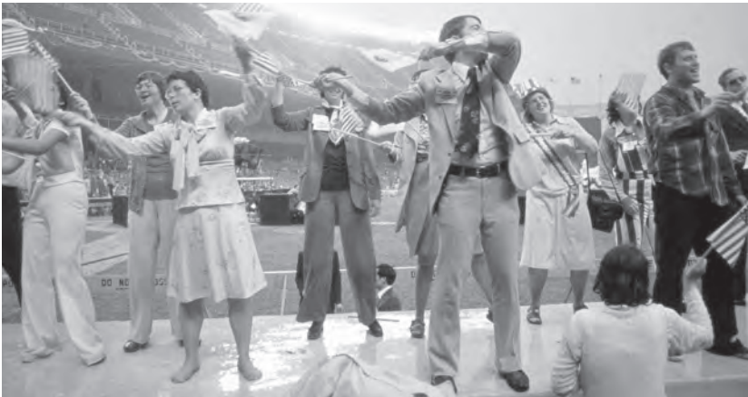
Unification Church members lead the crowd in "You Are My Sunshine," the song that created a miracle

And on that first day of June, others gathered as well. Just as in Korea, where from the right and left, Christians and communists united to accuse and attack, outside Yankee Stadium the demonstrators were