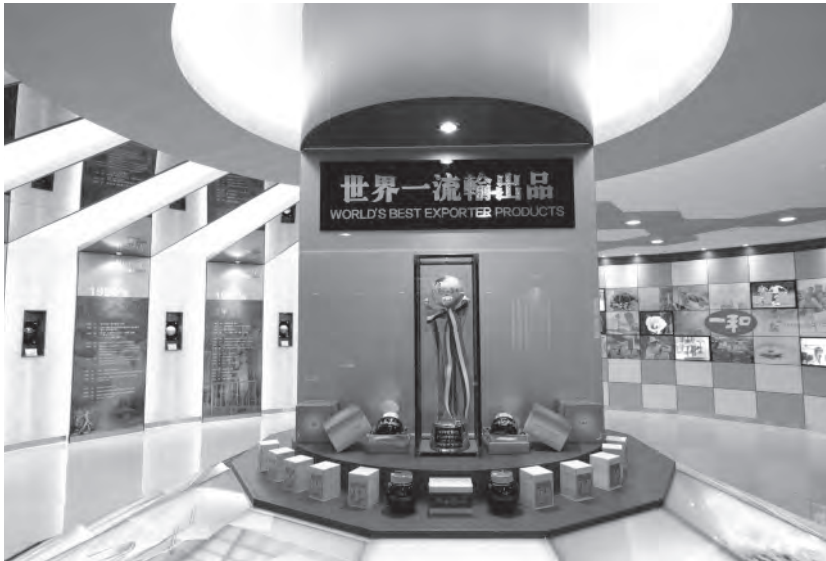
Research and development of Ilhwa Company Ltd., ginseng products for health

Next, we established the Ilhwa Company Ltd., which pioneered the export of high-quality ginseng products. Ginseng was unknown in the West at the time but now it is a household item. Ilhwa is recognized both for its excellent products and as a leader in ginseng science.