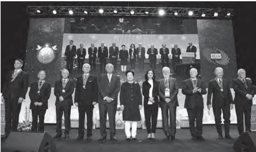
October 26, 2019: SouthEast Europe Peace Summit 2019, Palace of Congresses, Tirana, Albania

Finally, the challenge was fulfilled in October 2019 during the South-East Europe Peace Summit when 3,000 energetic school and college students gathered for the Youth and Students for Peace Rally in Tirana, followed by the launch of the Balkans Peace Road.