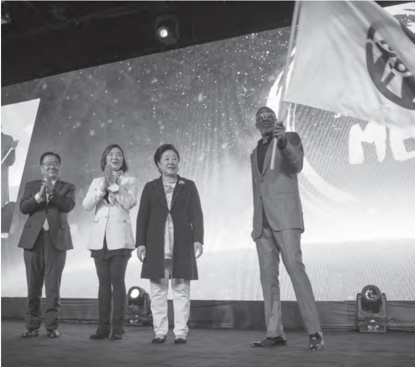
April, 2019, Mother Moon with Bishop Noel Jones of the City of Refuge Church, Los Angeles

True Parents. Who are the chosen people of this age? The answer is, you! You are the chosen people centered on True Parents in the 21st century.”