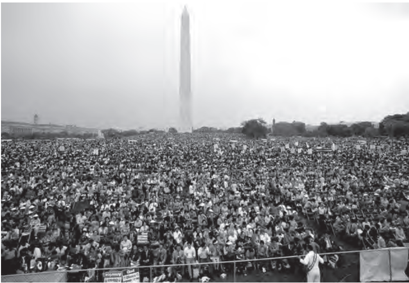
September 18, 1976: The God Bless America Festival at Washington Monument, Washington DC.

Arrayed against us at the Yankee Stadium and Washington Monument events were more than 30 opposition groups, including the US Communist Party. Nonetheless, without a trace of fear or the remotest consideration about pulling back, my husband and I set aside our personal safety and dedicated our lives to the future of the United States. We invested all we had to wake up the American churches and people to the reality of God, the truth of the Bible and the supreme importance of God-centered marriage and family life, beyond race, nation and religion. Declaring this message on the vast expanse of the National Mall was our goal, and nothing could change that.